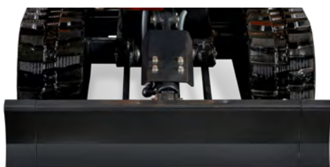
Extended undercarriage 840 mm - Increased stability