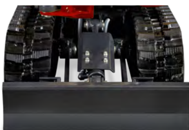
Retracted undercarriage 680 mm - Best manoeuvrability