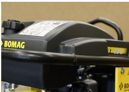
High level of reliability Corrosion-resistant fuel tank