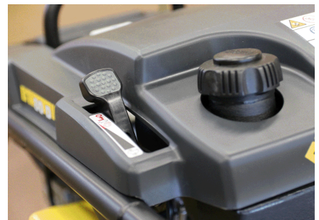
Simple operation Engine control via lever (on/off/speed)