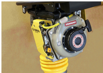
Low CO2 emissions Yanmar diesel engine